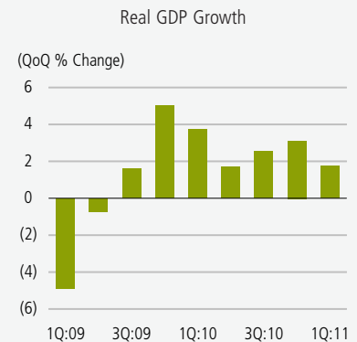
Display 1 Slow Start to 2011

As of March 31, 2011